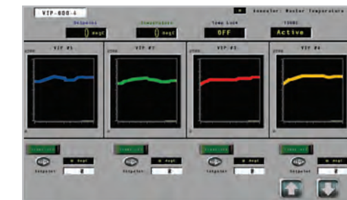
Smart Anneal™ Seam Temperature Data Logging Screen